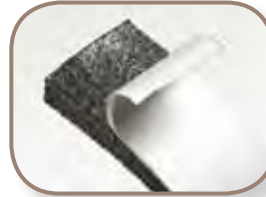
Previous to Expansion